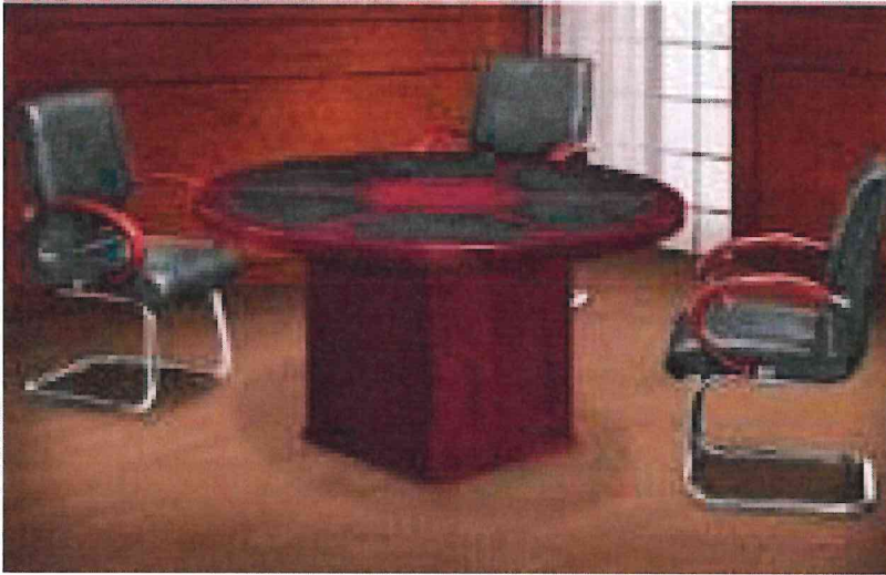
Fig. 3: Conference Table 1500mm with Leather Mahogany Wooden Veneer.