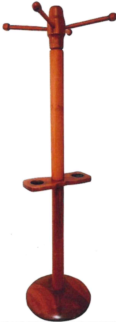
Fig. 9: Executive Hat & Coat Stand with Brass Hooks.