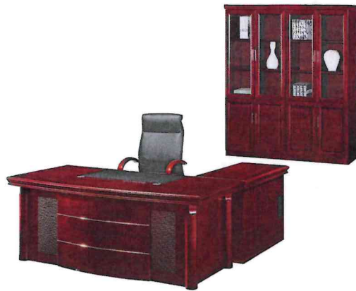
Fig. 1: Starling Executive Desk with Credenza and Pedestal Mahogany Veneer.