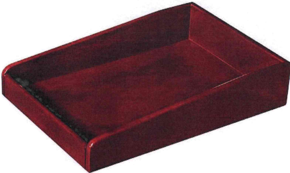
Fig. 8: Wooden Letter Tray Mahogany Veneer.