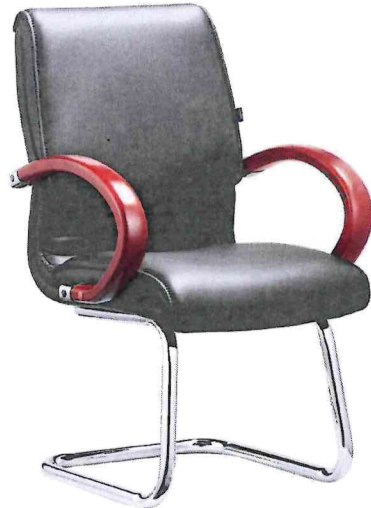
Fig. 5: Beijing Executive Visitor Chair Genuine Black Leather Mahogany Wooden Armrests.