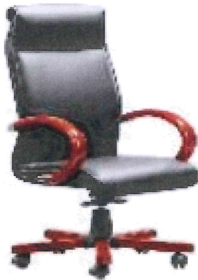
Fig. 4: Beijing Executive High Back Genuine Leather Mahogany Wooden Armrests and Base.