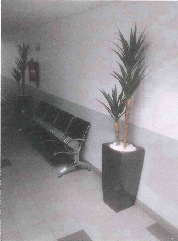
Fig. 7: New Yucca Rostrata Base Bush in Fiberglass Bubble Urn.